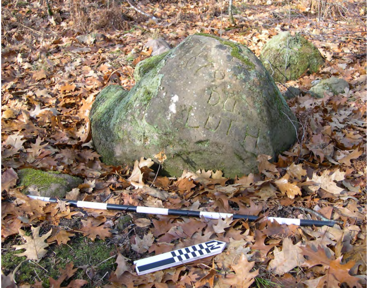
Figure 1. The Du Luth Stone in November 2009, view to northwest; one-meter scale with 10-cm intervals.

It is impossible to precisely date carved inscriptions or rock art images from examination of mineral weathering. Relative dating is certainly possible, however, and in this sense the Du Luth inscription appears to be “old,” but there are simply too many variables (stone type and mineral hardness, exposure to or protection from elements, lichen growth, moisture, changes in local environment through time, etc.) to independently determine an absolute date for the carving’s origin. In my opinion, a better sense of the inscription’s authenticity, or lack thereof, can be gained from an analysis of historic contexts. This also cannot confirm a calendar date, but it can provide an informed assessment of probability, or at least possibility. While not proof, this is a useful exercise upon which future site investigations can be planned, if warranted, and that is the goal of this article.