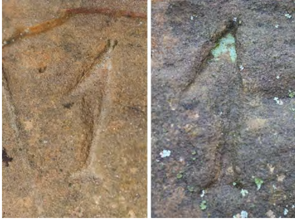
Figure 5. Comparison of the numeral 1 in “1679” in November 2013 (left) and October 2014 (right).