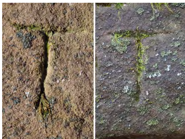
Figure 13. Comparison of the letter T in “LUTH” in November 2013 (left) and October 2014 (right).