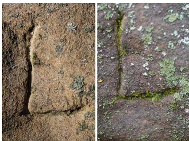
Figure 11. Comparison of the letter L in “LUTH” in November 2013 (left) and October 2014 (right).