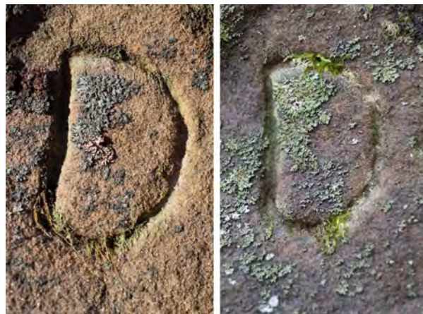
Figure 9. Comparison of the letter D in “DU” in November 2013 (left) and October 2014 (right).