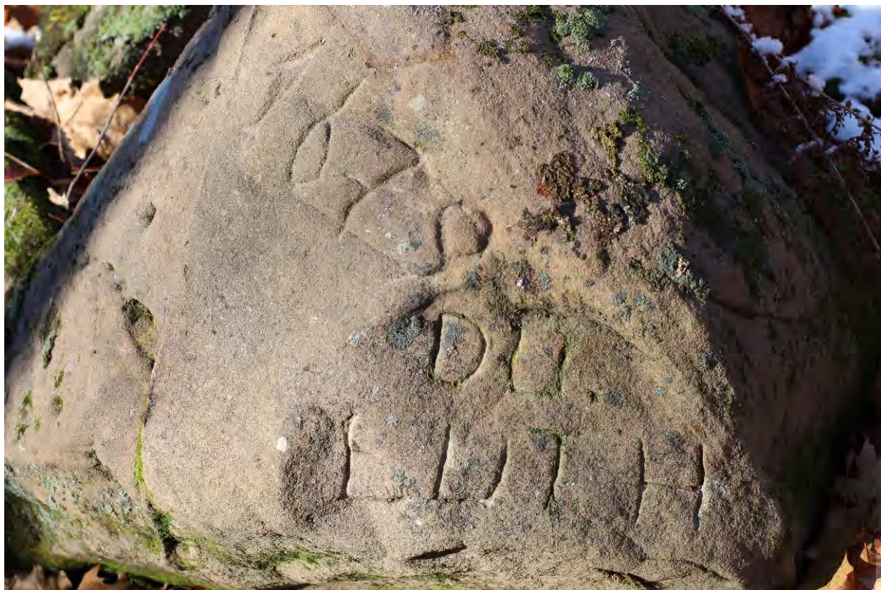
Figure 4. Detail of the Du Luth Stone inscription in November 2013.

At the site, the new landowners took us to the inscription. Wolter swept the perimeter of the boulder with a metal detector, with negative results. He examined the inscription with a hand lens and pointed out a small indentation above and to the left of the “1” in “1679” (it is visible in Figs. 4 and 5). He identified it as a carved dot, and a coded reference to the Virgin Mary. I am certain that it is not a reference to the Virgin Mary, and this is a good point to mention that there are small natural vugs in the sandstone boulder (Fig. 15). I think that the dot/hole by the “1” is one of them. I suspect that the dot following the first “U” (in “DU”) is another (Fig. 10). For this reason, I transcribe the inscription as “1679 DU LUTH” rather than “1679 DU. LUTH” as Birk did (1981a, 1992:11-12).