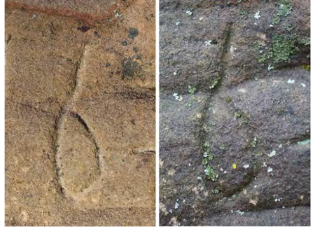
Figure 6. Comparison of the numeral 6 in “1679” in November 2013 (left) and October 2014 (right).