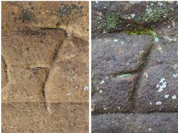
Figure 7. Comparison of the numeral 7 in “1679” in November 2013 (left) and October 2014 (right).