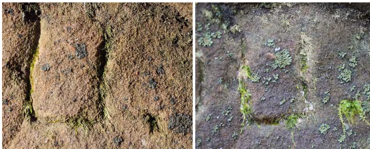
Figure 10. Comparison of the letter U in “DU” with possible period or dot, in November 2013 (left) and October 2014 (right).