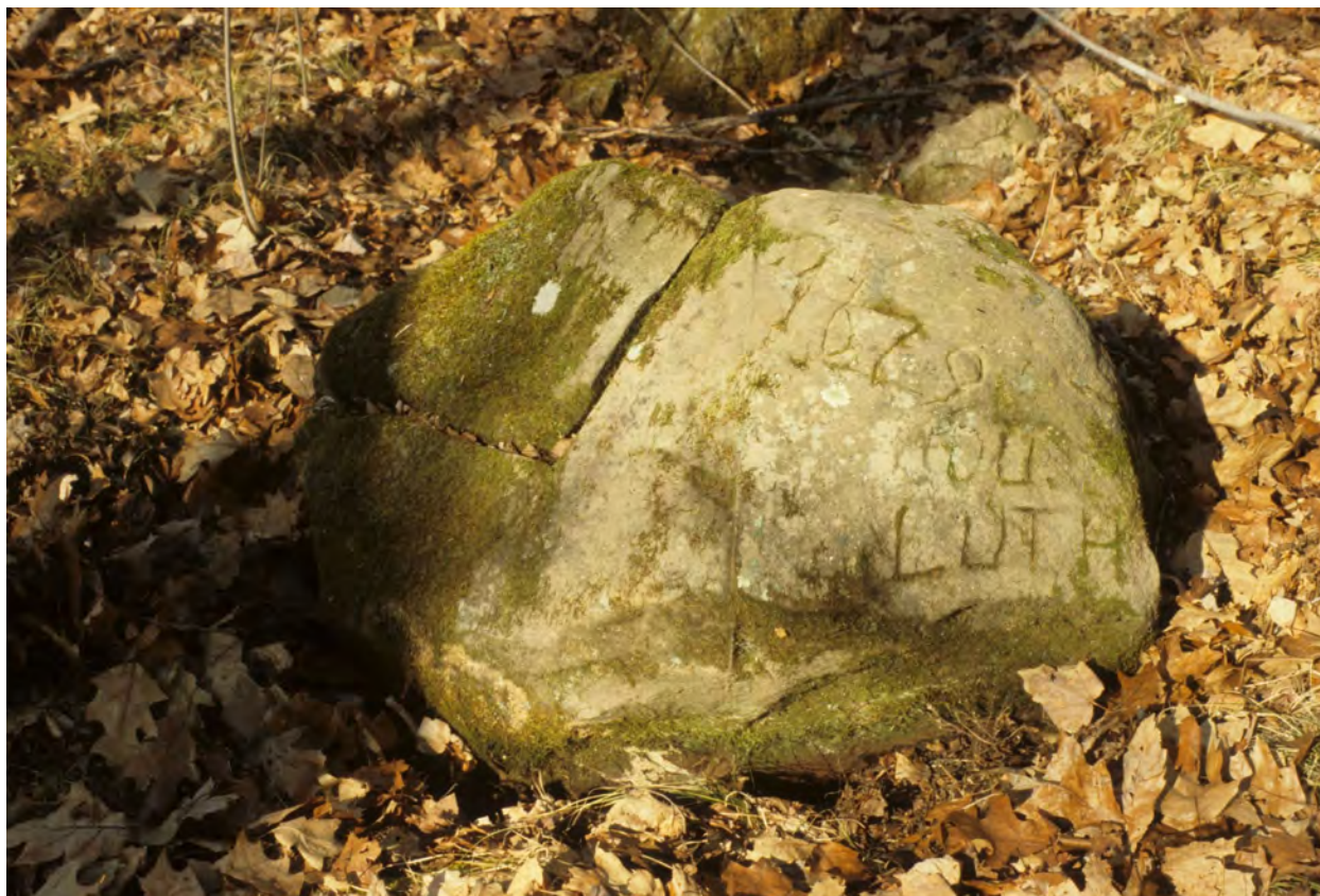
Figure 2. The Du Luth Stone in 1981.

1981, my observations of the site between 2009 and 2014 amid interactions with pseudoarchaeology, and a brief discussion of the role of context development in historic preservation.