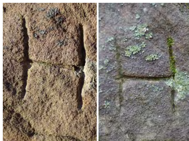
Figure 14. Comparison of the letter H in “LUTH” in November 2013 (left) and October 2014 (right).