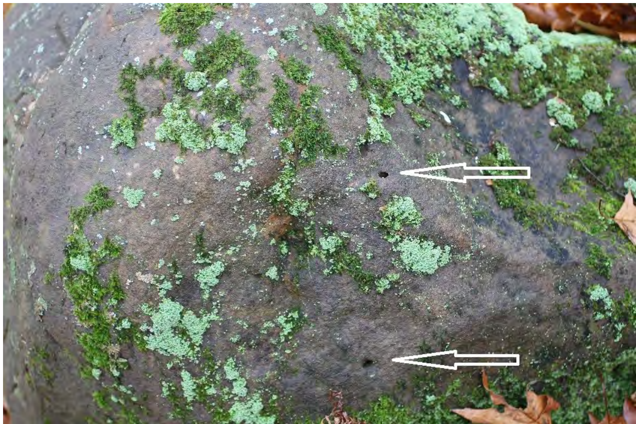
Figure 15. Natural vugs (indicated by white arrows) in the Du Luth Stone, on the side opposite the inscription.