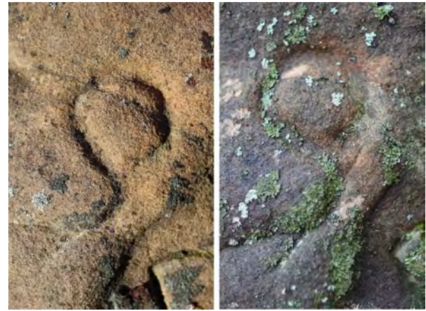
Figure 8. Comparison of the numeral 9 in “1679” in November 2013 (left) and October 2014 (right).