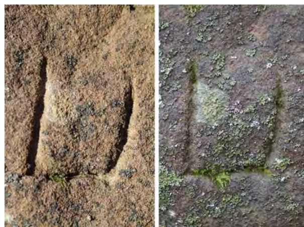
Figure 12. Comparison of the letter U in “LUTH” in November 2013 (left) and October 2014 (right).